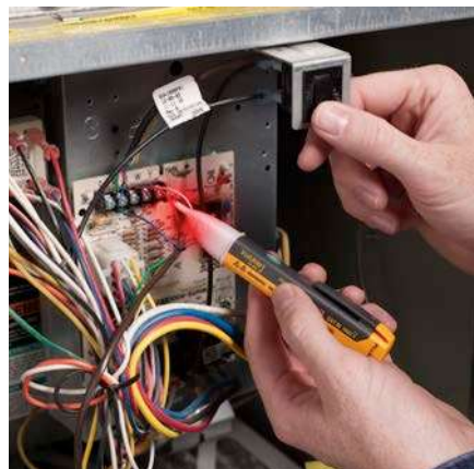
Low volt version

Fluke. Keeping your world up and running.®